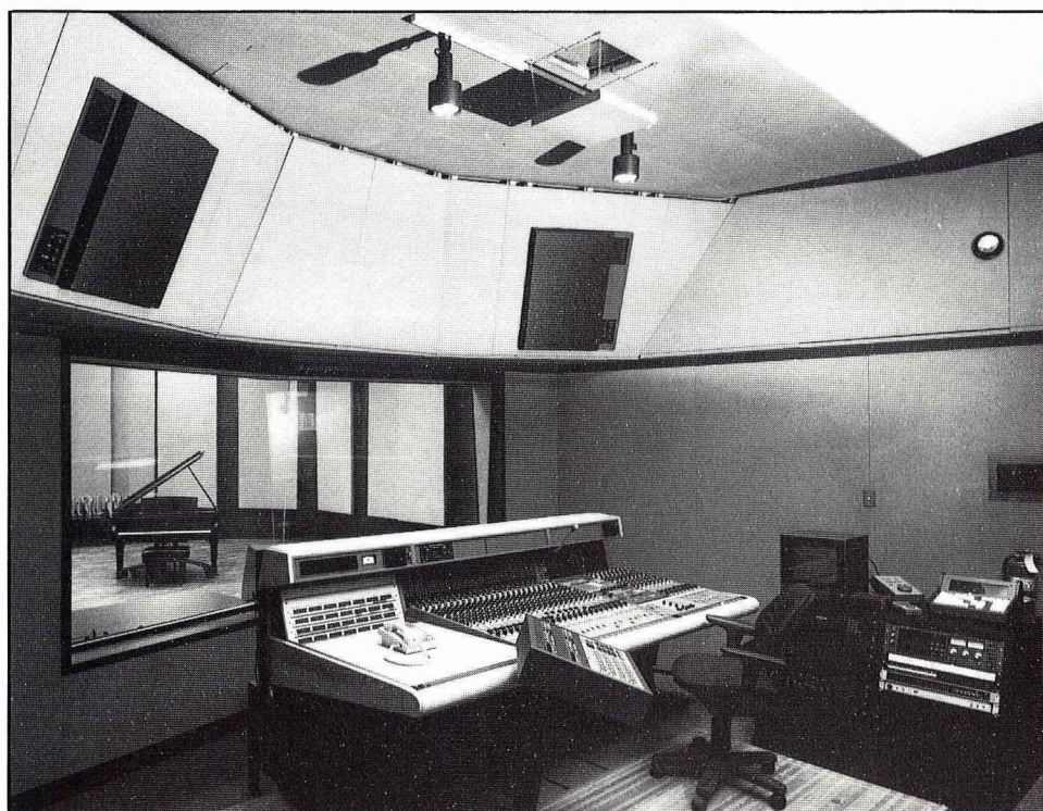
University of Southern California, School of Cinema-Television, Spielberg Scoring Stage, Los Angeles, CA

“ The School of Cinema-Television at the University of Southern California chose the UREI Model 813 for its Spielberg Scoring Stage because its widespread use in recording studios makes it an industry standard. Furthermore, its ruggedness meets the requirements of a teaching institution since students do make mistakes; the UREI 813 is very forgiving.”