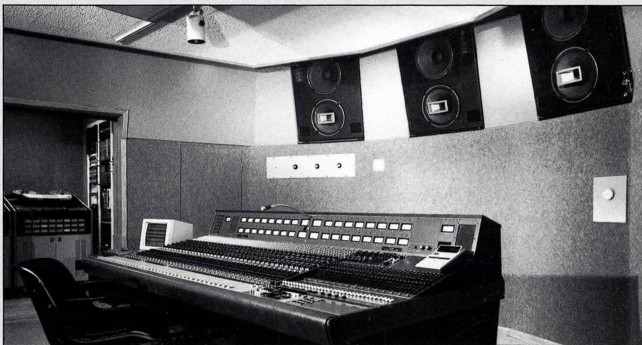
Hitsville Studios, Motown Records, Hollywood, CA